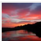
The Ten Essentials