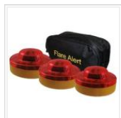
Are You Prepared for Hazardous Winter Conditions?