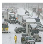
Gov. declares winter preparedness day