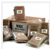
Food and Water